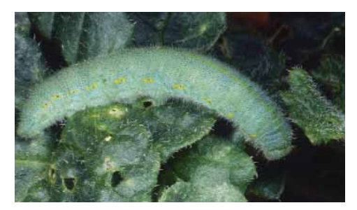
Caterpillar of the small white cabbage butterfly.

Where an aphid infestation is small it's often best to simply squash them with your fingers. For more serious