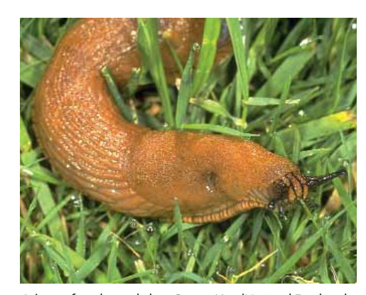
Arion rufus, the red slug.