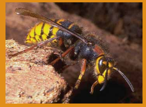
The French wasp Dolichovespula media is now common in many gardens.

aphids in its short life, together with scale insects and young caterpillars. The larvae look like small, flattened, green maggots.