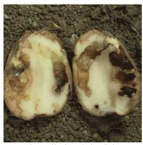
Potatoes damaged by slugs.

These also attack tayberry, blackberry and loganberry. Remove mulches in the