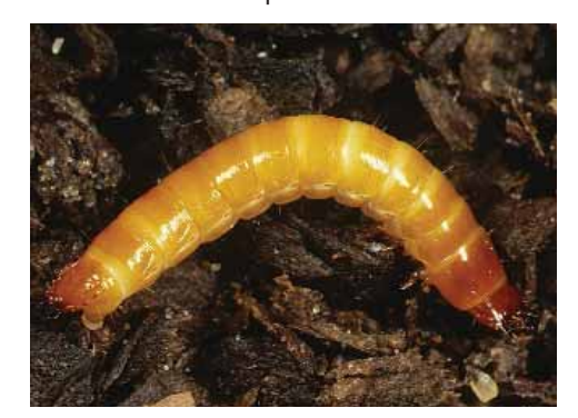
A wire worm Athous haemorrhoidalis.

These are rarely a problem, but they may gnaw the stems of young or weak seedlings at ground level. Avoid mulching very young plants as this gives woodlice cover. Woodlice have very weak jaws and are unable to attack older transplants.