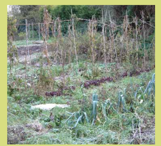
Old growth can make a valuable refuge for overwintering wildlife. Stephen Arnott/Natural England