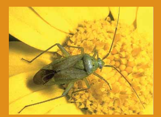
The potato capsid Calocoris norvegicus .

closely related green-veined white is not a pest species). Squash their oval, yellow eggs when you find them and exclude the adults with a fine mesh netting.