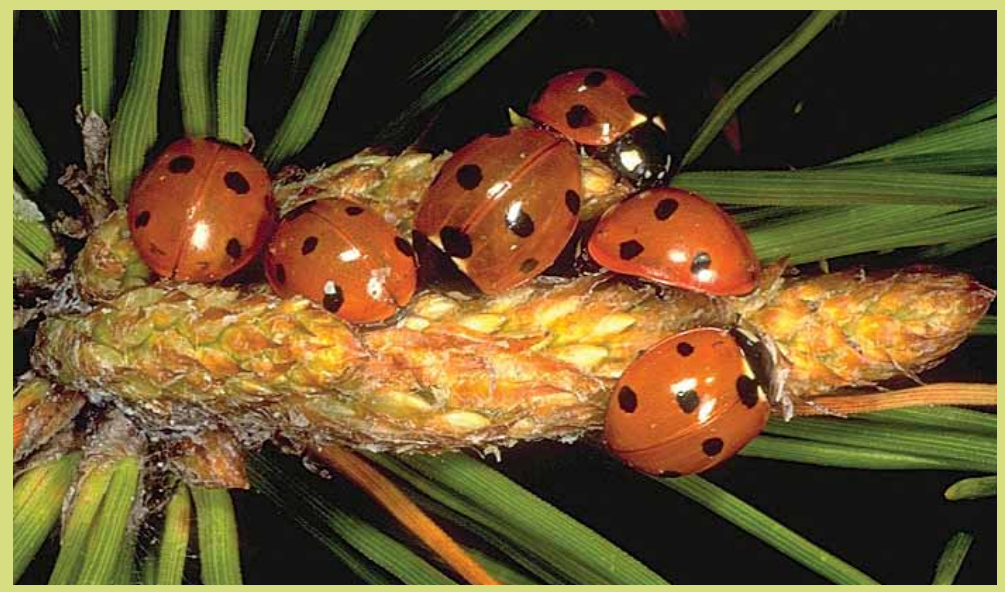
A valuable ally, the seven-spot ladybird Coccinella septempunctata. Roger Key/Natural England