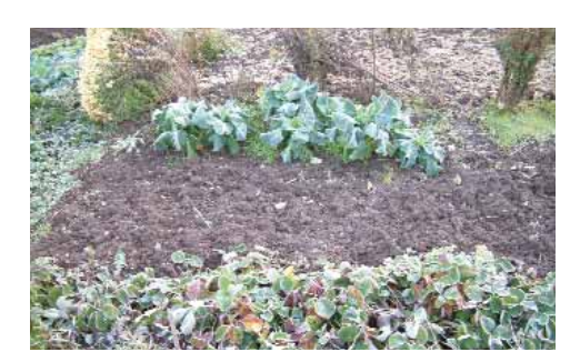
Winter digging exposes pest larvae to predators and the cold.

The latter is important as a number of notorious pests survive the winter as ground-dwelling grubs, including