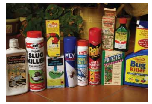
They all work, but they may kill friend as well as foe.

Attracting beneficial wildlife can be quite straightforward and this leaflet contains many tips for doing so. However, once you've encouraged some of nature's helpers to live on your plot you can't expect them to do all the work! A healthy population of predators on your allotment will help subdue a host of pests, but sometimes even they will be overwhelmed. In these cases you may have to step in to remove infested growth or even whole plants.