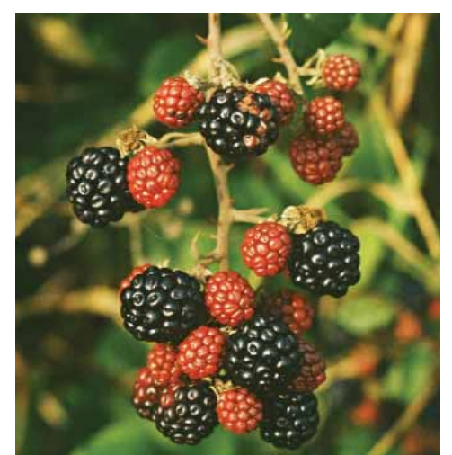
Brambles will provide food and shelter for a wide variety of beneficial wildlife. Peter Roworth/Natural England

local frog population, these amphibians being some of the best slug predators there are. Unless you have a very large plot it's unlikely you'll be able to sacrifice the space for a substantial pond, but within the wider allotment area there might be a suitable patch of land that is lying unused.