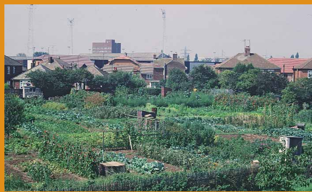
Allotments are a refuge for both people and wildlife.

Allotments have been around for a long time. They were originally created for poor agricultural workers to compensate them for the loss of common land during the enclosures of the eighteenth century. Allotments