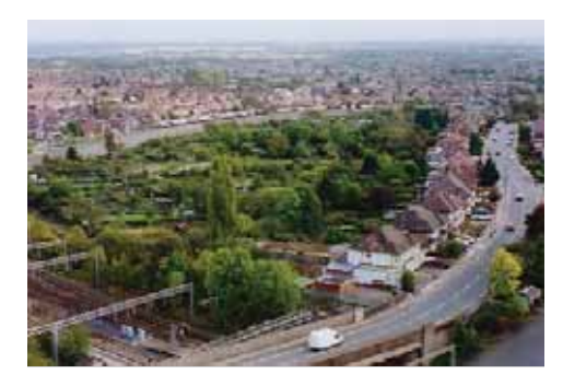
An urban oasis. Federation of City Gardens

The situation was different in towns. Here, labourers welcomed the chance to be out in the fresh air, grow their