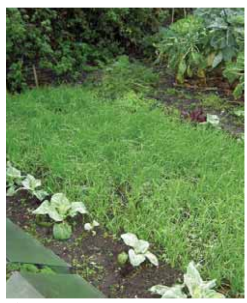
A fallow bed sown with Italian rye-grass Lolium multiflorum.

Comfrey is another plant that can be used to increase fertility. It has long roots that tap into stores of nutrients that have leached deep into the soil, the result being that comfrey leaves contain nearly as much nitrogen as farmyard manure and twice as much