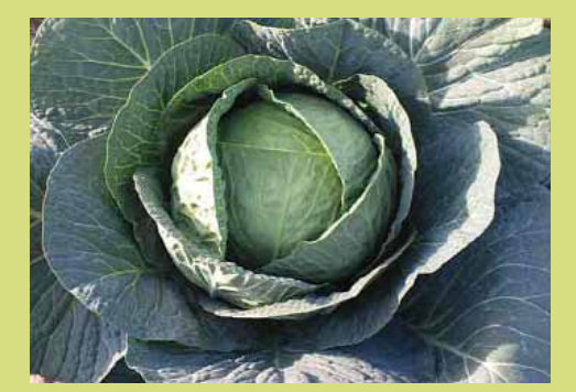
Cabbages and beans seem to make good planting partners.

A field trial by Garden Organic (formerly the Henry Doubleday Research Association) found that, where onions and carrots are grown together (and onions outnumber carrots four to one), attacks of carrot fly are far less severe. It is believed that the smell of the onions masks that of the carrots, literally throwing the carrot flies 'off the scent'. Onions and carrots make good companions for another reason – carrots are long-rooted and