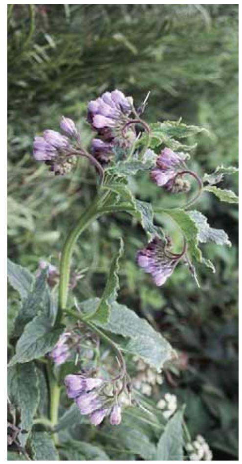
Comfrey makes an excellent liquid manure.

potassium. Some gardeners maintain a patch of comfrey and use its leaves to make a liquid manure. To make your own, steep 1 kg of leaves in 15 litres of water, let the mixture stew under cover