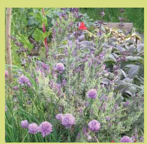
Strong-smelling herbs may distract or repel pest species.

Other useful companions are legumes, such as lupins, that fix nitrogen with their roots for the benefit of adjacent crops. It seems that companion plants can even be from the same species. Research has shown that non-resistant cultivars can benefit when interplanted with disease-resistant varieties of the same crop. The theory is that resistant rows act as barriers, blocking the path of pests and diseases that might otherwise pass easily from plant to plant.