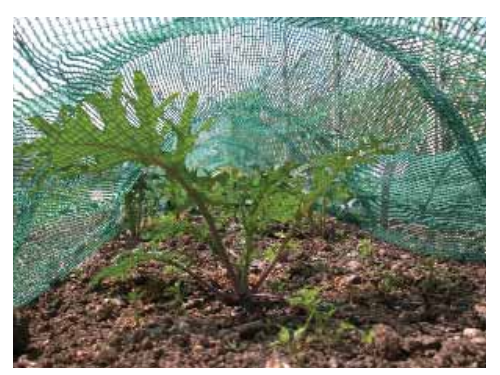
Netting will exclude a wide variety of pests. Garden Organic