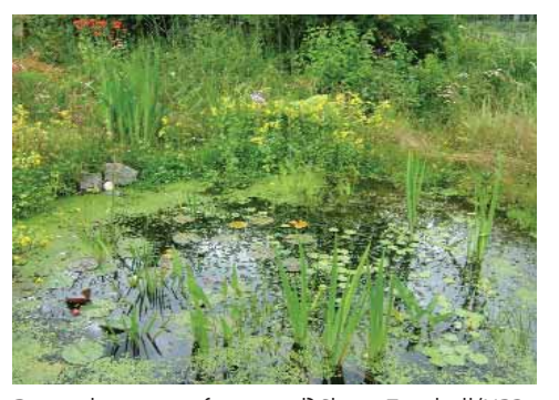
Do you have room for a pond?

In some cases the use of pesticides has even created pest problems! For example, the fruit tree red spider mite only became a significant pest in the 1930s following the widespread agricultural use of tar-oil sprays – the mites could cope with spraying far better than their predators and thrived as a result.