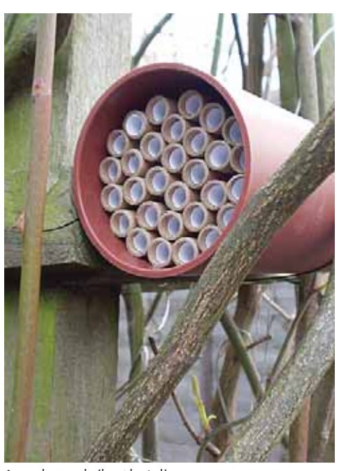
A ready-made 'bug hotel'.

There are many different groups of beetles and although some (flea beetles, for example) can be a nuisance, many are valuable allies. Useful species include ladybirds, ground beetles, rove beetles (such as