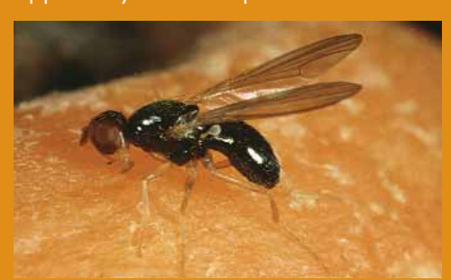
Small but pesky; the carrot fly Psila rosa

This fly lays its eggs in the soil or occasionally on the plant itself. Cover the ground with fleece or a fine mesh straight after sowing or planting, or protect individual plants with special root fly mats. You can buy these or make your own from 12 cm squares of any soft woven material. A traditional remedy is to plant young brassicas in holes lined with rhubarb leaves. Apparently the smell puts them off.