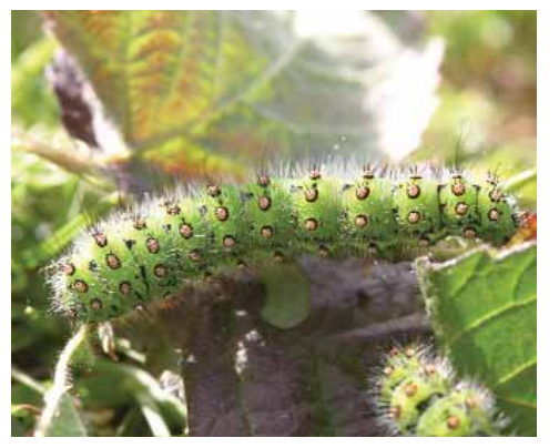
An emperor moth caterpillar Pavonia pavonia on bramble.