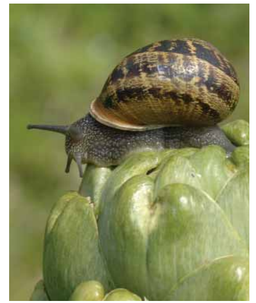
Snails like artichokes too.

relies on the barrier being dry and, even when it is, many slugs can burrow underneath. Laying copper strips or old copper pipes around raised beds can help as these generate a weak electric current that slugs find unpleasant.