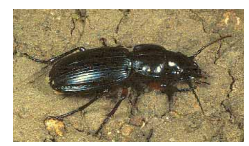
A ground beetle Pterostichus madidus.

One way of controlling pests without resorting to chemicals is to try companion planting – a system where different plant species are grown