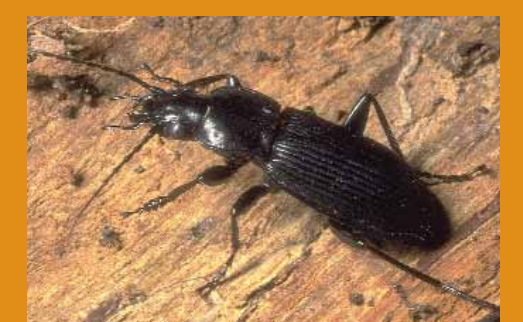
Ground beetles like Pterostichus niger will appreciate undisturbed ground.

Large-scale beetle banks are often seen on organic farms where field margins and mid-field strips are deliberately left unploughed. Some allotment holders subdivide their plots into separate beds using grass strips, and beetles will benefit if you broaden