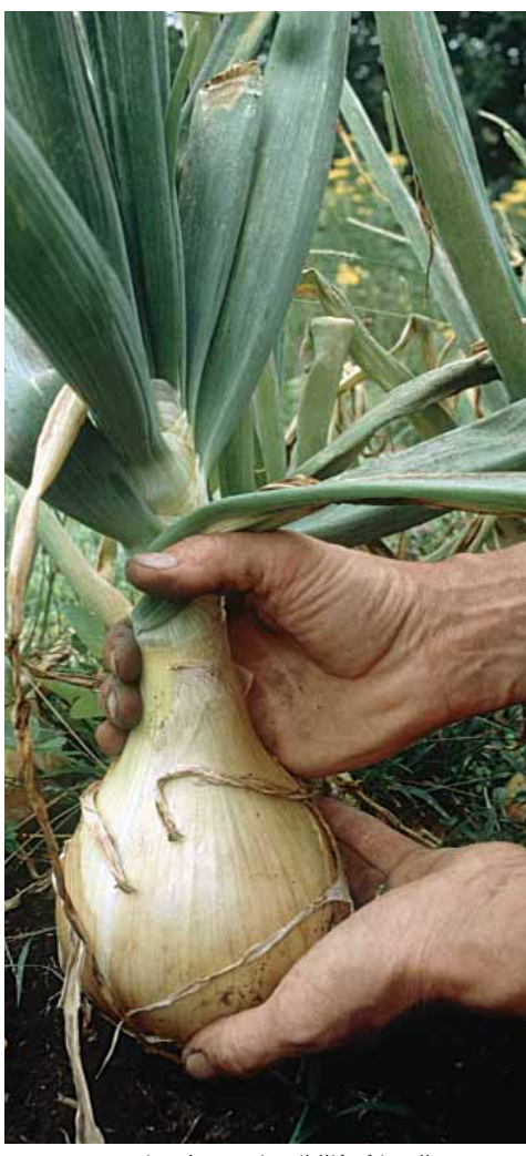
Know your onions! Organic wildlife-friendly gardening can produce great results.

heritage varieties to their catalogues. Why not introduce a few heritage vegetables to your plot? Apart from the fun of trying something different, the interplanting of heritage and hybrid varieties of the same crop could have advantages (see Companion planting, page 22).