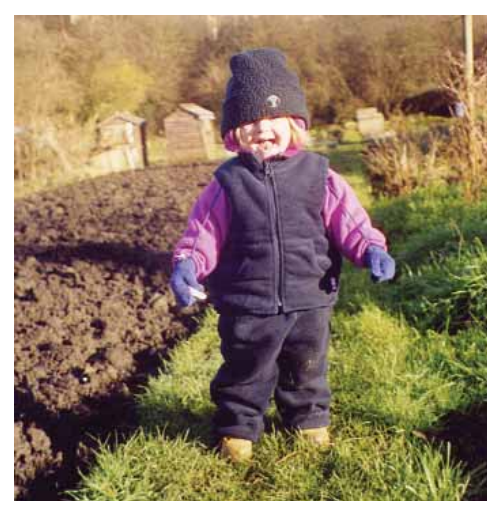
The next generation will need allotments too. Federation of City Gardens

Despite their popularity, allotment numbers have been in decline since WWII. In 1950 there were over one million in the UK, but today that number has dropped to around 250,000.