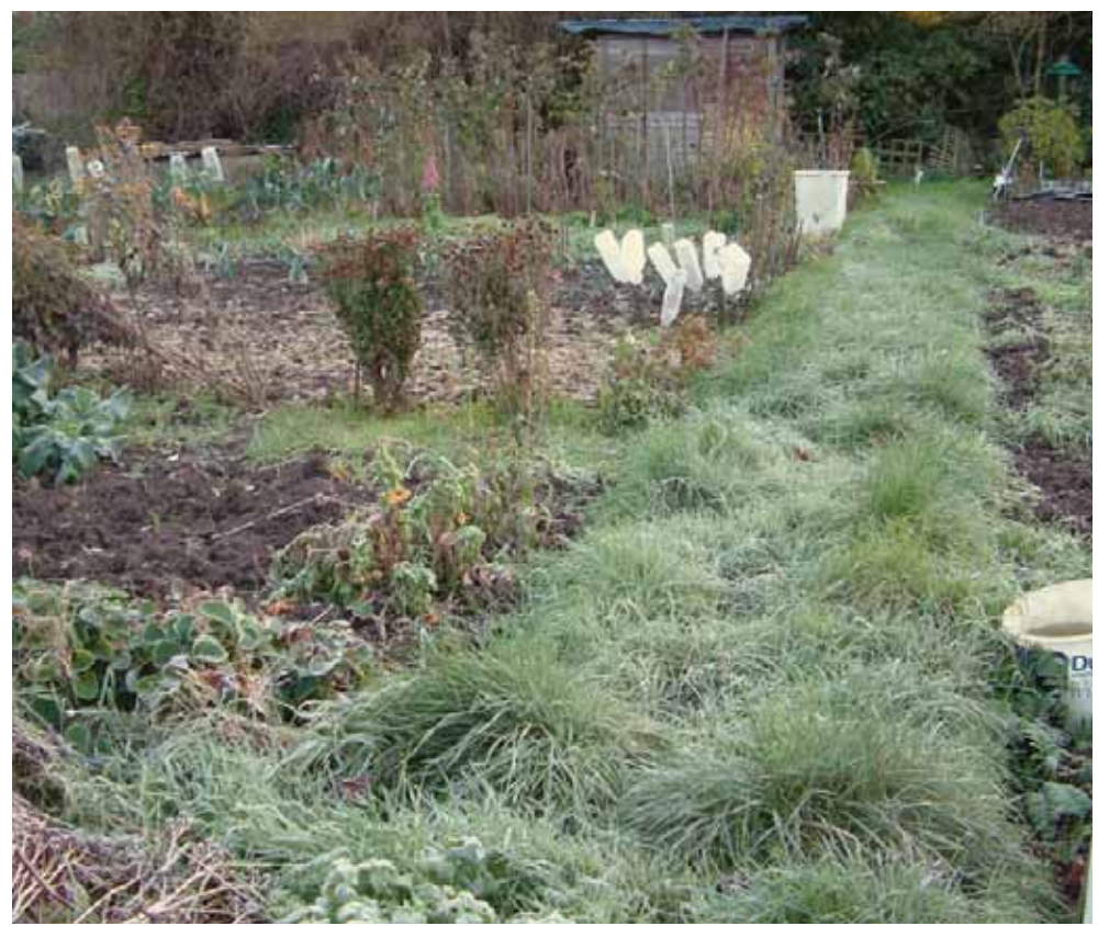
Broad grassy strips make excellent refuges and breeding sites for predatory beetles.

the devil's coach-horse) soldier beetles and carrion beetles. All these prey on common pests such as slugs, snails and caterpillars. Ground beetles are thought to be the 'number one' slug predator, better even than frogs!