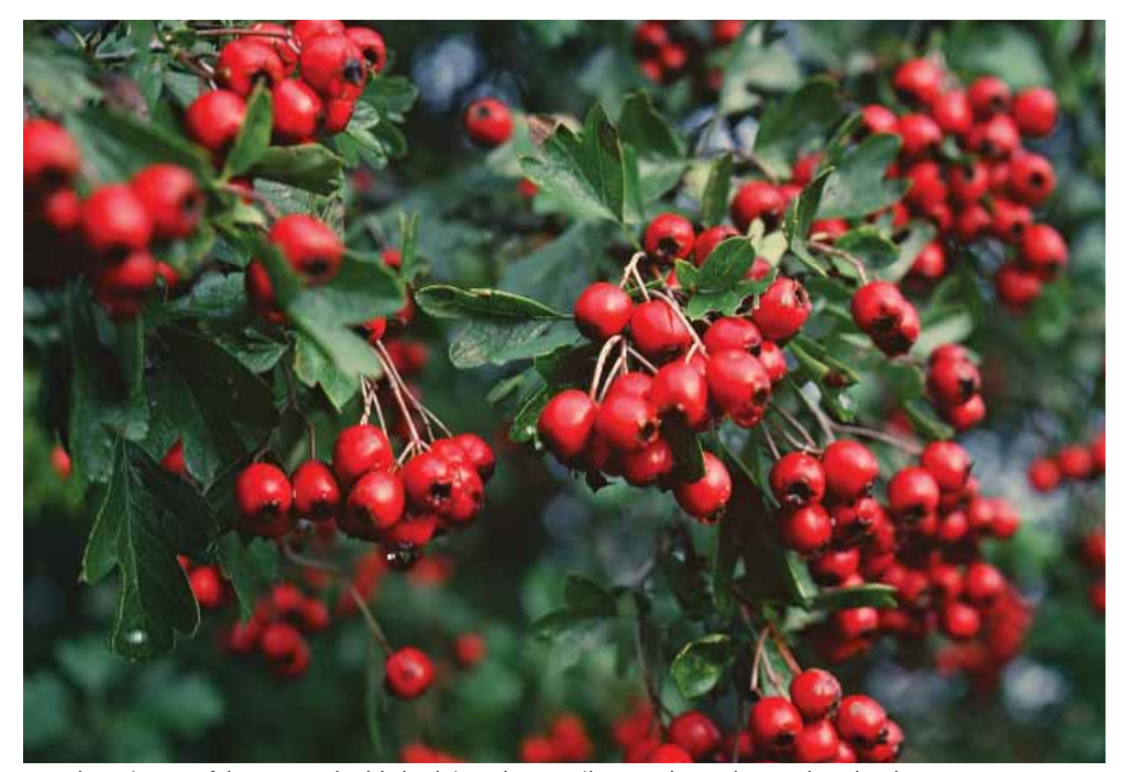
Hawthorn is one of the most valuable hedging plants.

Of all the hedge plants the most valuable must be hawthorn: it is fast growing, tolerates most soils, responds well to pruning and supports a huge range of wildlife. However, it must be allowed to flower to reach its best so time any pruning accordingly. If there is a hedge on your allotment, prune it in late winter after the berries have gone, but before the start of the nesting season as it is illegal to disturb nesting birds. The end of January is a good time. To lessen the impact of pruning, cut back only a third of your