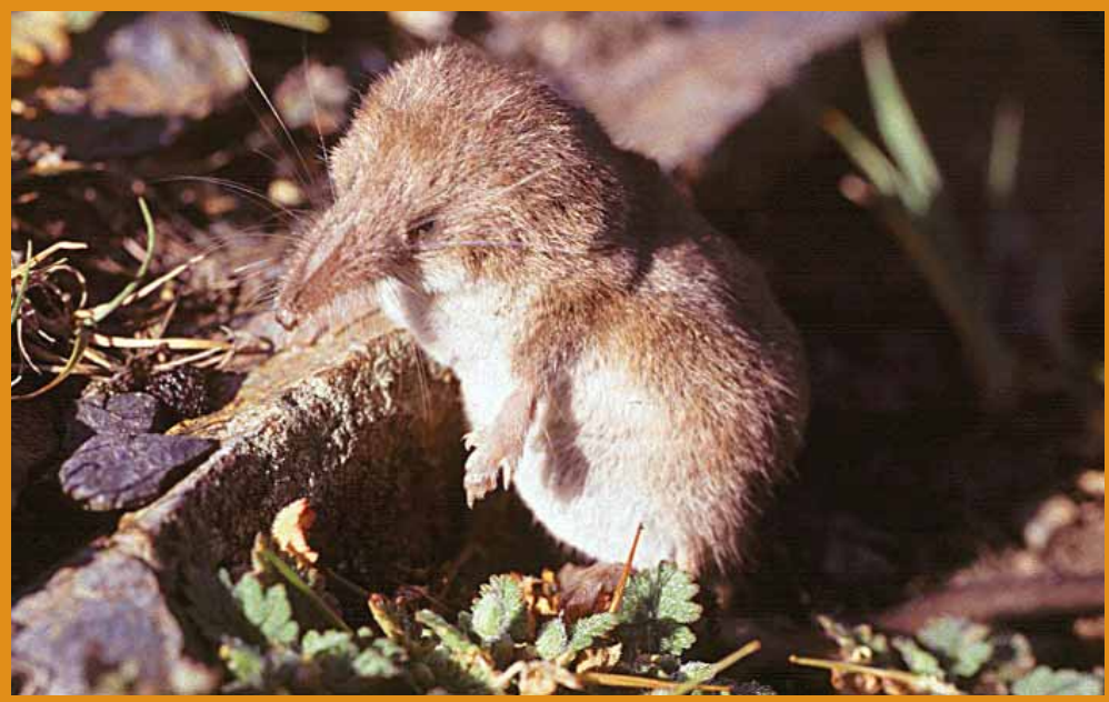
A pygmy shrew Sorex minutus on the look out for its next meal.