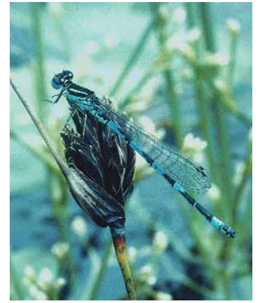
A pond will attract many kinds of predator, such as this southern damselfly Coenagrion mercuriale .

Before creating a pond you must obtain the permission of your allotment authority. Ponds can be a hazard, especially where young children are concerned.