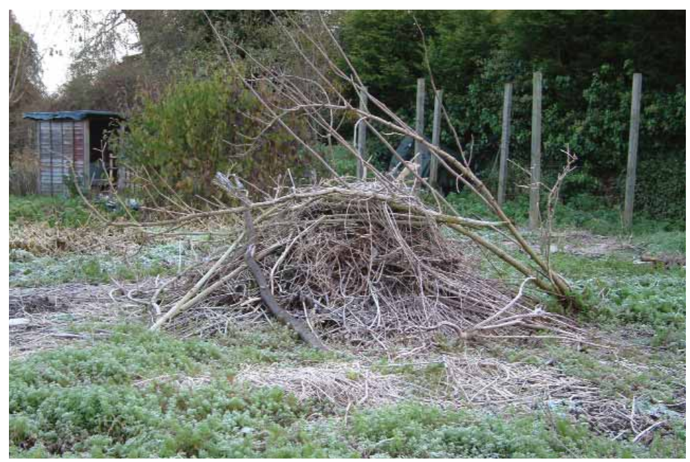
A bonfire pile can be a valuable winter refuge.

If your allotment suffers the unwelcome attention of human pests why not bolster your security with a prickly wild hedge? Holly, blackthorn, buckthorn, gorse, hawthorn, pyracantha and berberis can all be planted to create a prickly barrier; while bramble, dog rose and sweet briar can be grown through existing man-made fences to make climbing them a thorny problem!