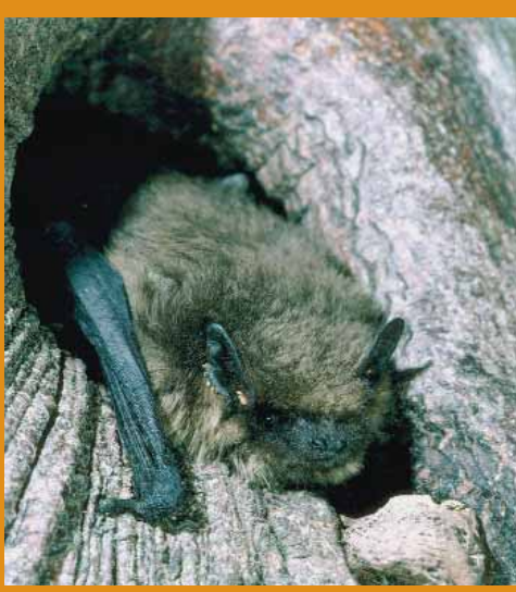
A single pipistrelle bat can catch over 3,000 flying insects in a night.

boxes and provide drinking water. For detailed advice on building and positioning bird boxes get in touch with the British Trust for Ornithology (BTO) or the RSPB (see Contacts, page 37). Most plots should be able to accommodate a small nesting box, but perhaps the wider allotment area provides opportunities for a more ambitious housing project? For example, is there a site that could accommodate a box for owls? A family of these night-hunters on the premises