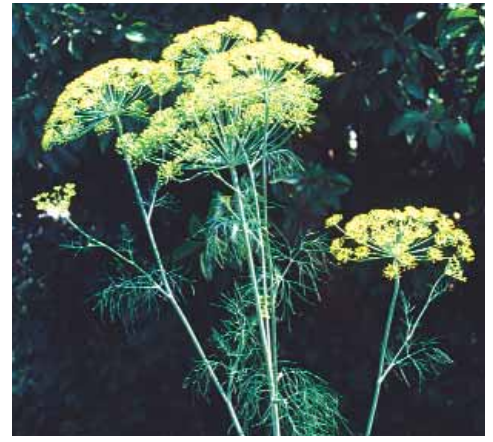
Plants such as dill Anethum graveolens have open umbelliferous flowers that are popular with many insects.

berries for food. Plot holders can also benefit from this natural harvest; the berries and flowers of elder, rosehips, and blackthorn sloes all having a use in