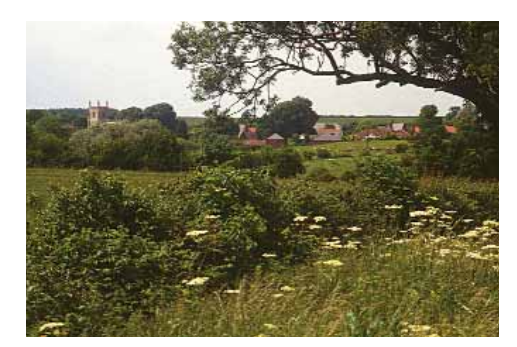
Diverse, wildlife-friendly farmland is under threat from intensive agriculture.

proved a good way of alleviating rural poverty and their creation became official government policy in 1845. By 1873 there were 242,000 of them, one allotment for every three male agricultural workers in England.