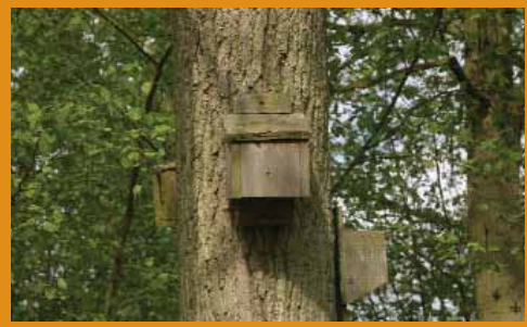
Bats need boxes too!

boxes and provide drinking water. For detailed advice on building and positioning bird boxes get in touch with the British Trust for Ornithology (BTO) or the RSPB (see Contacts, page 37). Most plots should be able to accommodate a small nesting box, but perhaps the wider allotment area provides opportunities for a more ambitious housing project? For example, is there a site that could accommodate a box for owls? A family of these night-hunters on the premises