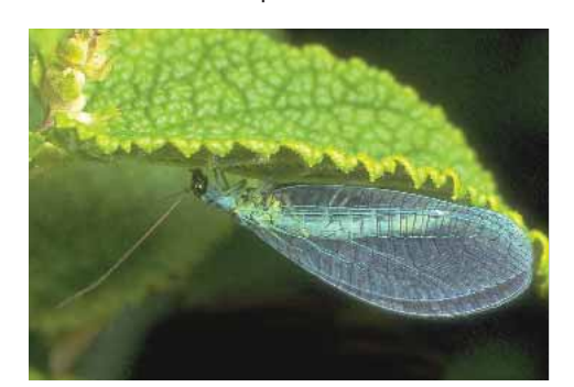
Look after beneficial insects such as the green lacewing Chrysopa carnea .

The key to getting wildlife to work with you is to look after the beneficial creatures that already live on your allotment and to encourage more – and different ones – to settle there. Perhaps the easiest way of conserving wildlife is to reduce your use of toxic chemicals, ideally cutting them out all together (see also Companion planting, page 22). Most toxins found in pesticides are non-specific and are just as likely to kill friends as foes. Spraying against pests will often kill their predators as well, meaning that the next wave of pests that blows in