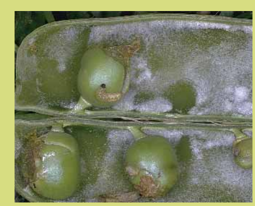
The pea moth caterpillar Cydia nigricana .

Most of the millipedes you see in your garden will be harmless but a few burrowing species are troublesome. The worst villain is the spotted-snake millipede that can damage root crops and potatoes. There's little that can be done about them but as they often exploit damage caused by pests such as slugs, action against these will often limit the damage millipedes can do.