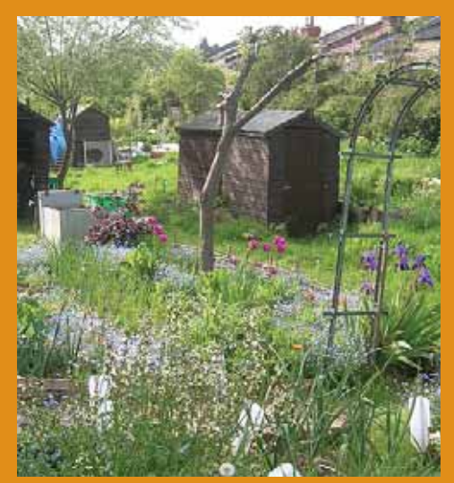
An urban allotment.

A number of organisations are working to reverse this trend including the National Society of Allotment and Leisure Gardeners (www.nsalg.org.uk) and the Allotments Regeneration