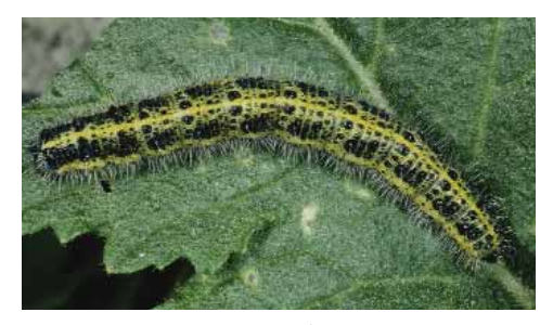
A large white cabbage butterfly caterpillar Pieris brassicae.

Two species of butterfly, large whites and small whites, are often lumped together as 'cabbage whites' (the