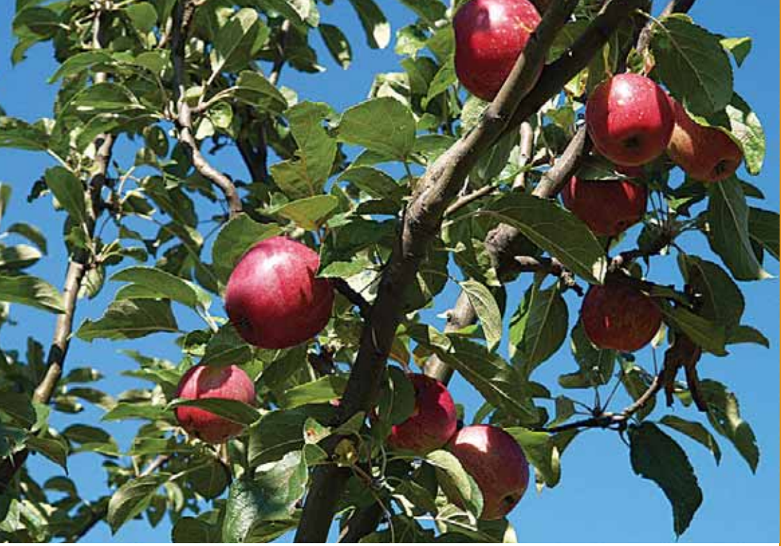
Orchards can be superb wildlife habitats.

they are not controlled. You should take particular care to control pernicious weeds such as couch grass to make sure they don't cause a problem for other plot-holders.