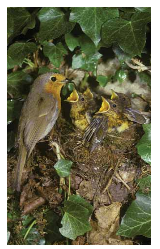
Time hedge pruning to avoid the nesting season.

hedge in rotation each year. This leaves one third undisturbed for at least two years. Remember to consult your allotment authority if you plan to replant an old hedge or start a new one.