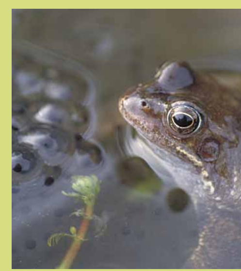
A prime slug predator, the common frog Rana temporaria.