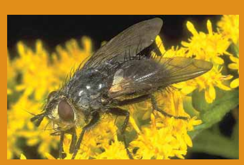
A tachinid fly. Their larvae are parasitic on many pest species.

The adults are not carnivorous but most hoverfly larvae are ravenous hunters: each consumes around 900