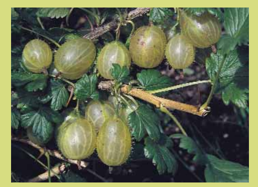
Expose pests by growing gooseberry plants as a cordon or fan. Mr Fothergill's