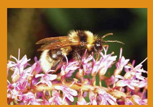
The small garden bumblebee Bombus hortorum

These will create a multitude of habitats for beneficial animals. Even a small stone pile on your plot will be a home to useful beetles and centipedes. Larger piles may shelter slug-eating frogs, toads and slow-worms or, very occasionally, a family of stoats or weasels to help keep down any local rodents and rabbits. Hedgehogs can also benefit from these structures (though logs will have to be at least 10 cm apart) but if you wish to encourage them to feed on your slugs it might be