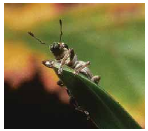
The pea and bean weevil Sitona lineatus.